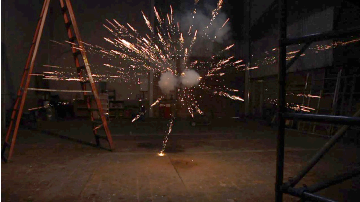
Sophie Clements – There, After – currents 2012