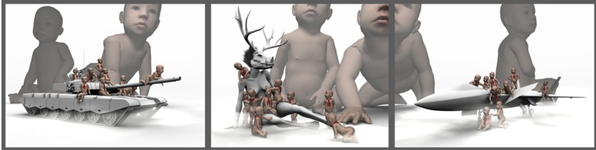
Yefeng Wang – Well Disciplined Kids – currents 2012