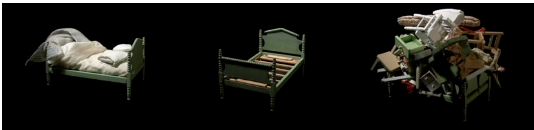
Amy Jenkins – Bedroom Waltz (Triptych) – currents 2012